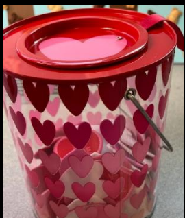
100 Heart Shapes in a Jar