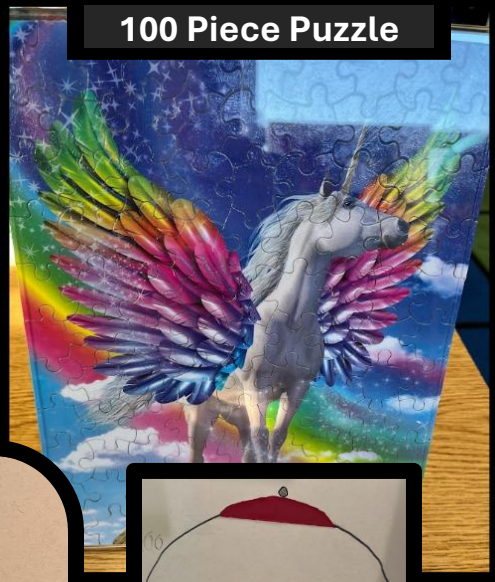
100 Piece Puzzle