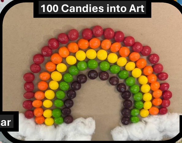
100 Candies into Art