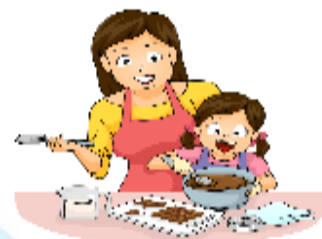
This Photo by Unknown Au-